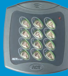
ACTsmart2 1080 / 1090