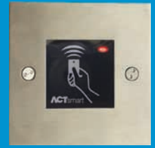
ACTsmart2 1070PM (with ACT PM Flush Plate - purchase separately)